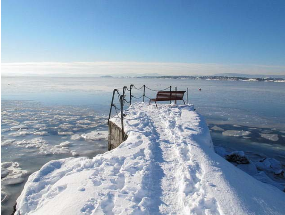
The Oslo fjord in winter.

Have a nice and peaceful Festive season. The CAS secretariat will soon take some days of for Christmas holidays. Greetings from a wintry Oslo, see you all in 2015.