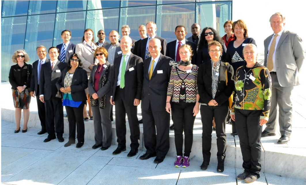
The 12 th CAS meeting in Oslo, Norway at the Opera roof in Oslo.