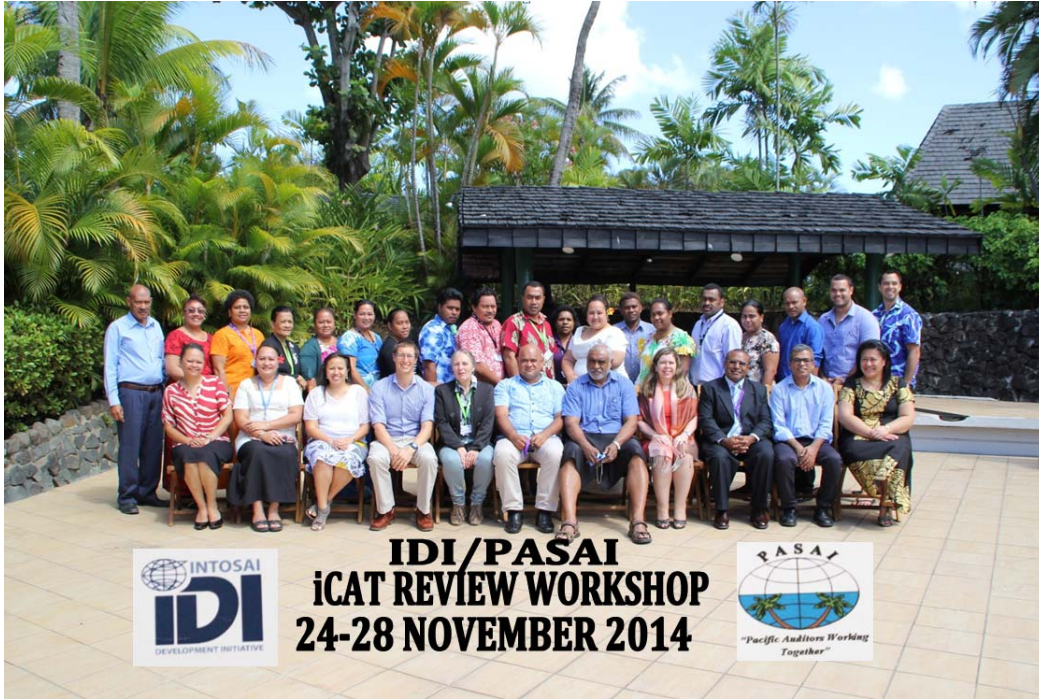
IDI iCAT Workshop in PASAI, Fiji in November 2014. Representatives from all three audit streams from different countries, representative from FAS, PAS and CAS and the secretariat of PASAI.