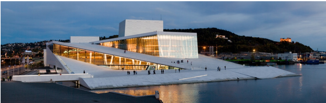
Oslos new Opera hall

In order to discuss and decide the further path of the new ISSAI 4000 Compliance Audit Standard of INTOSAI, an annual committee meeting will, as always take place. In 2014 the CAS Chair and secretariat are happy to announce that we will be welcoming you all to our capital Oslo, Norway. Further information on the meeting will be provided when the time approaches.